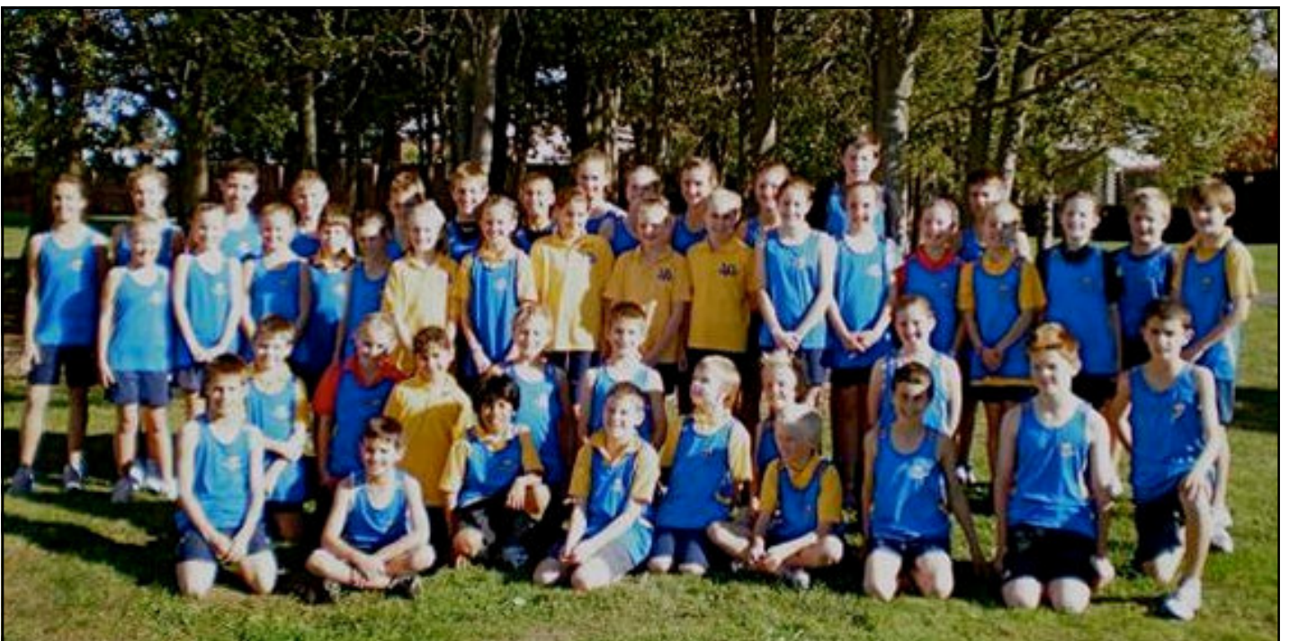
St Joseph's 2010 Cross Country Team