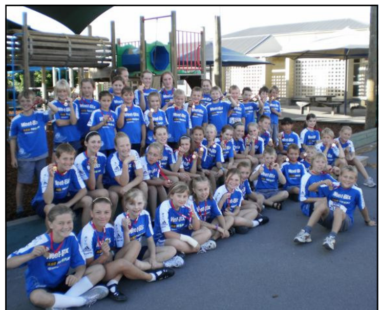
Competitors from last Sunday's Weetbix Tryathlon